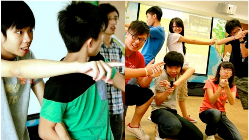
We used drama to facilitate the sharing to the youth from Operation Mobilisation (HK)