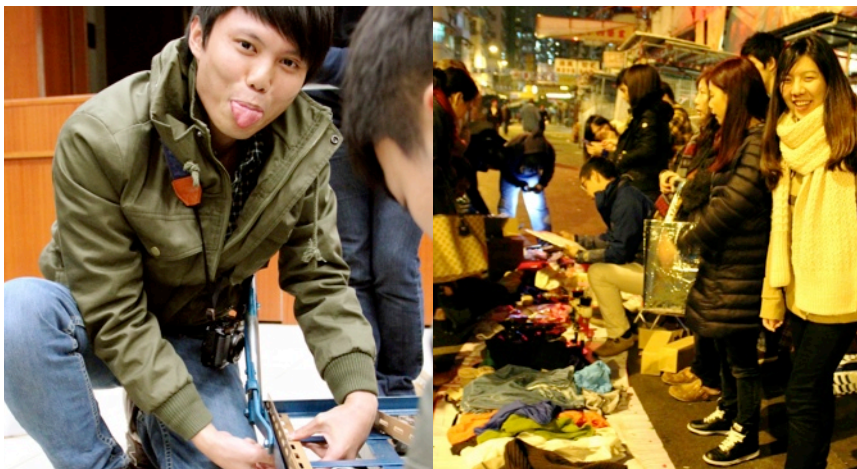
A group of teacher-to-be joined a workshop to learn how to build a hawker trolley and be a hawker at Sham Shui Po mid-night market