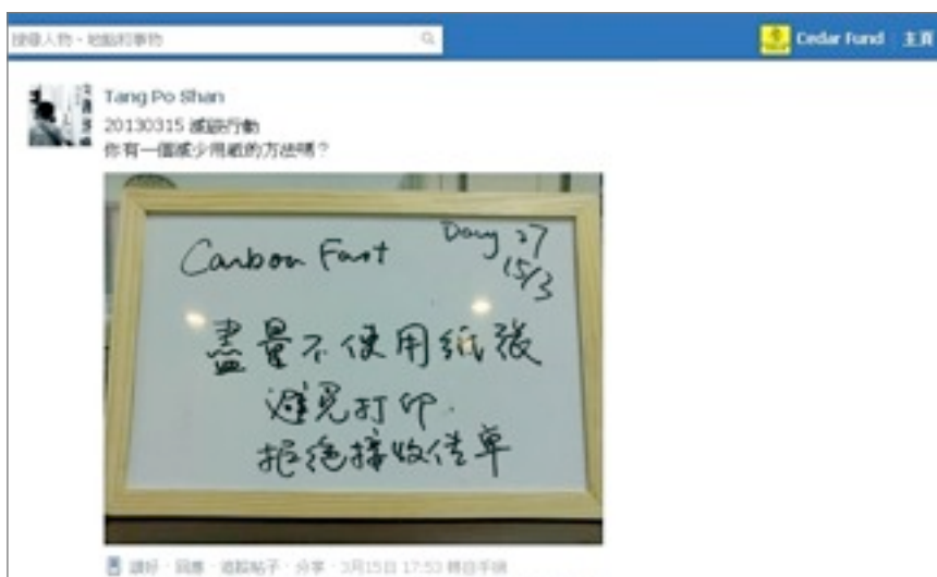
'Carbon Fast Army' shares on Facebook

'What can be done?' is most frequently asked question after our sharing with churches. CEDAR regards 'remembering the poor' as an important element in our Christian life, and our faith is enacted in our daily lives. Therefore, by reviving the meaning of each different festival and important day we encourage churches and believers to live out a life of loving the poor.