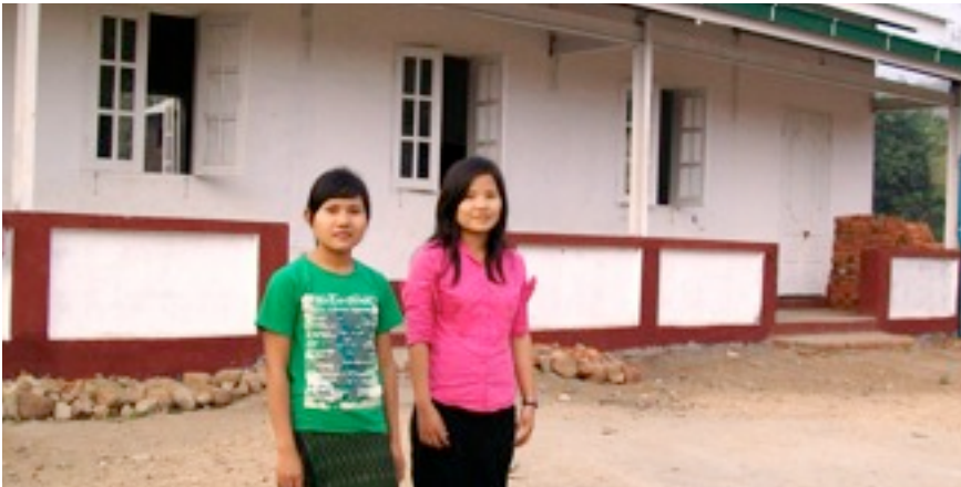
After training, two former Fullmoon children now teach in a newly built school in Mon State

In April 2012, CEDAR's partner Fullmoon received the Burmese government's invitation to establish post-war community rehabilitation in Mon State. Since then, we have done some work among the Karen people of Mon State such as building schools and training people on water management and agroforestry development. Further, we gathered a group of Karen war orphans who grew up in and now graduated from Fullmoon to return to their home state to participate in reconstruction. Some of these orphans have become teachers and medical personnel so they now contribute by teaching and providing medical care.