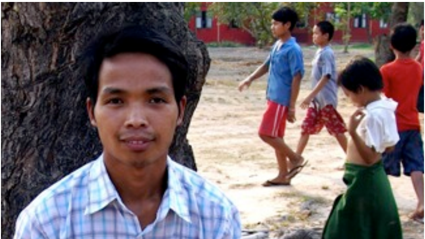
The Lisu pastor serving the displaced in the camp

There are 430,000 internally displaced in Myanmar, over 115,000 due to conflicts in Kachin State alone. In June 2011 the 17 year ceasefire agreement between Kachin Independence Army (KIA) and the state army lapsed and since then over 30 temporary camps along the border have not ceased taking in those fleeing Burmese soldiers.