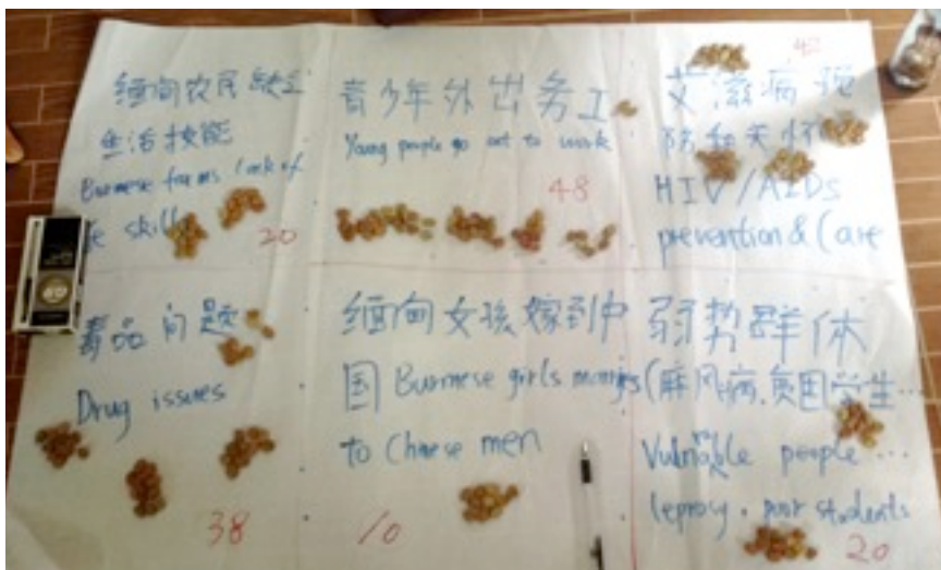
Representatives of China and Myanmar listed the social issues they were most concerned of.

As the social ministries of churches in places like Gengma are strengthening, CEDAR challenges them to collaborate with the Burmese churches to respond to social problems brought on by human trafficking such as youth labour, drug abuse and HIV/AIDS. Local churches are encouraged to provide a support network for the youth migrant workers enhancing their skills, and helping them to resist drugs and to prevent HIV/AIDS. These programmes are still being planned and discussed. We pray that God will continue to lead the churches in both countries so they may reach and minister to the marginalised and disadvantaged groups.