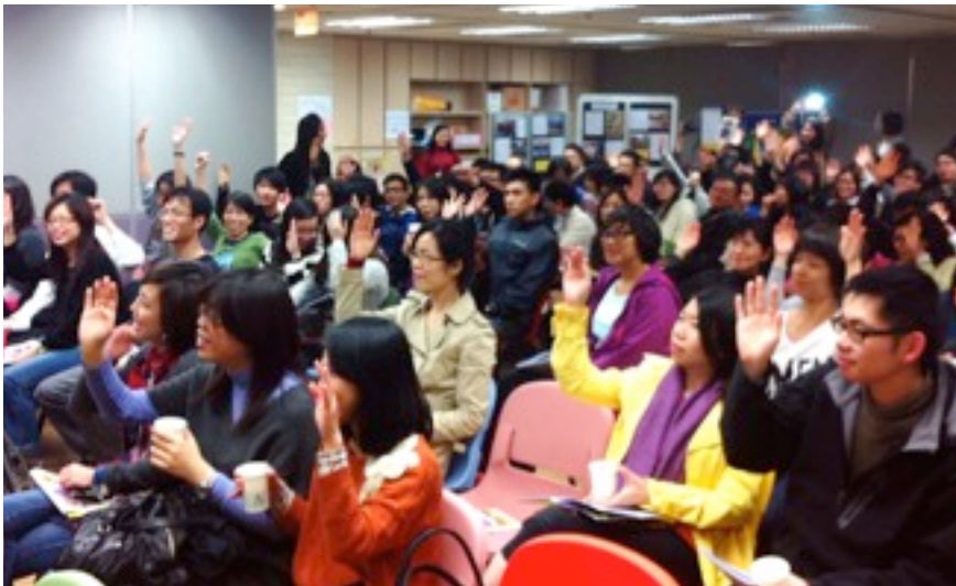
Over 90 people attended the after-trip sharing of Exposure Trip to Ethiopia on 12 April.

Overseas exposure trip is an important mobilising platform. In January 2013, 11 Hong Kong Christians went on an exposure trip to Ethiopia which greatly impacted their lives, and afterwards they hosted a meeting sharing with over 90 people about the trip and their reflections, thereby spreading the message of caring about the poor.