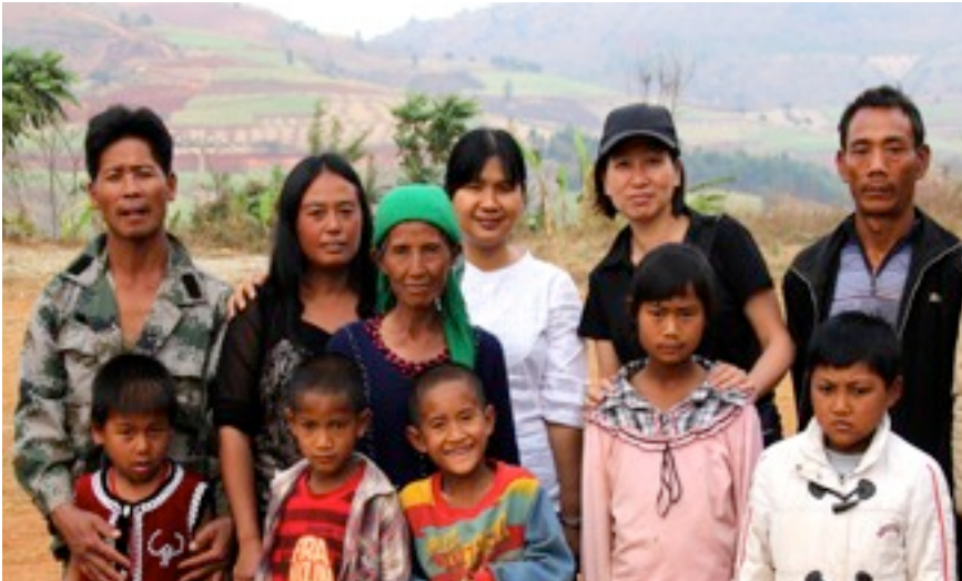
This is the community that the church in Gengma County, Yunnan, serves.

Over the past six years CEDAR has actively reached out to different provinces to provide training to churches on Integral Mission and to help establish social ministry. In March 2013, experts from Myanmar, England and China went to Yunnan and carried out external assessments on the effectiveness of CEDAR's local programs. Not only were the programs given positive comments, the local churches' social care works were also being affirmed.