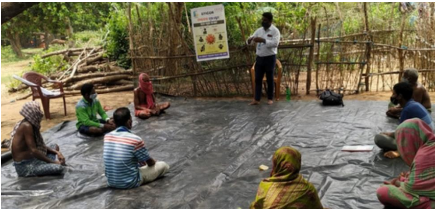
Staff are teaching the community members on pandemic prevention.

EFICOR promoted hygiene awareness in the community by teaching residents about the correct usage of masks, social distancing, personal hygiene, and the importance of vaccination. Masks and soap were also distributed to the community.