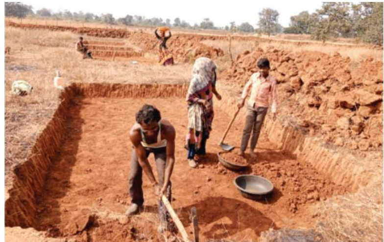
Cash for Work allows residents to obtain necessities and build their communities simultaneously.