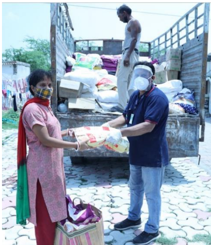
Staff distributing pandemic medical supplies.