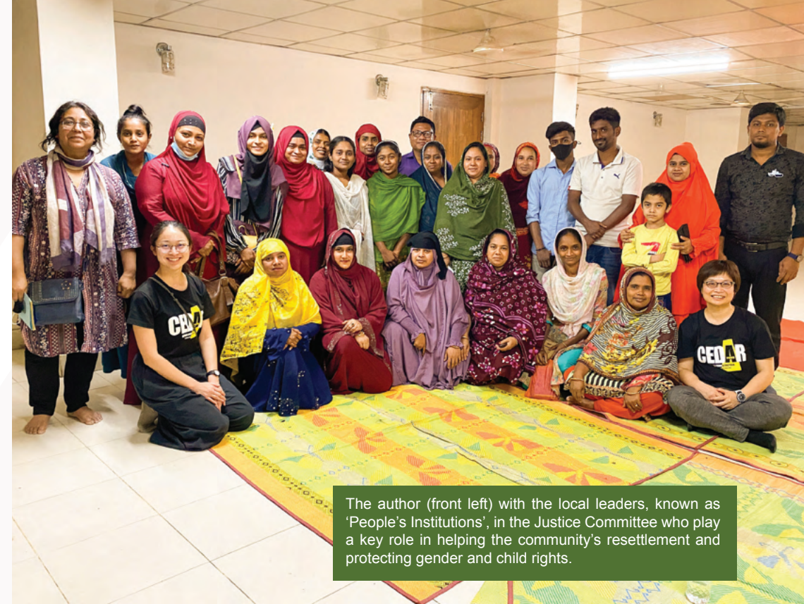
The author (front left) with the local leaders, known as 'People's Institutions', in the Justice Committee who play a key role in helping the community's resettlement and protecting gender and child rights.

In the face of hardships and adversity, we can feel so discouraged and helpless. But the little strength we have as individuals is multiplied beyond measure when we come together as a community in Christlike love. In community, we share one another's burdens and embrace one another's sorrows. In community, we find comfort in baring our vulnerabilities and find joy in strengthening others. In community, we learn to find solutions together and learn to trust God even when we can't. Our circumstances may be out of our control, but when we build each other up in the love of Christ, our resilience to endure and overcome challenges grows. That is the power of community in Christ.