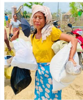
Tears of gratitude from a mother of six

Although the disaster was serious, the traffic was blocked and the price of relief items increased, which made the rescue operation difficult, our partner said that through this rescue operation, they reached the unvisited villages, prayed with the villagers, healed their broken and hopeless hearts, and shared the Gospel with them, so that they could experience salvation, and know that the Lord Jesus can bring blessings into their lives through the actions of believers.