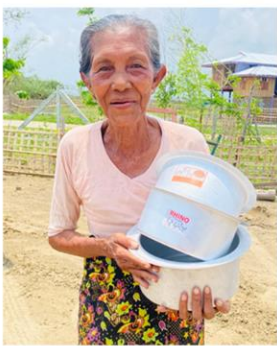
An 80-year-old woman living alone feels warmth when she receives the goods, and her worries about the future are reduced