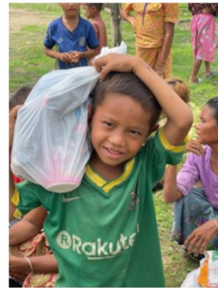
A boy raised by a single parent is happy that he doesn't have to go to bed hungry