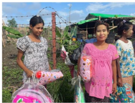
Pregnant women, whose homes were destroyed by the cyclone, find comfort in the distribution of baby