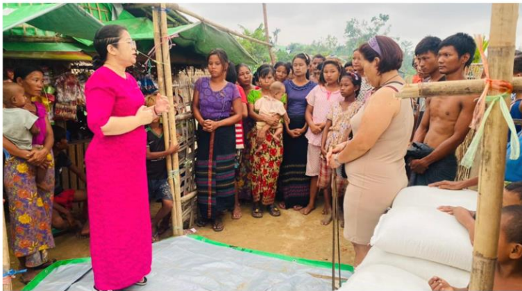
Distribution of emergency relief materials to 18 villages in Rakhine State